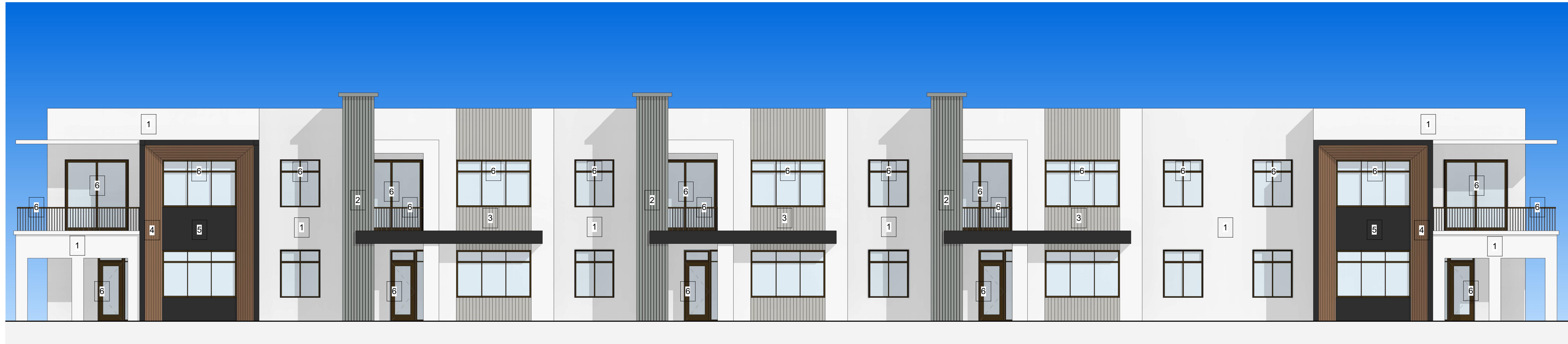
1 BUILDING #8, #9 EAST FACADE