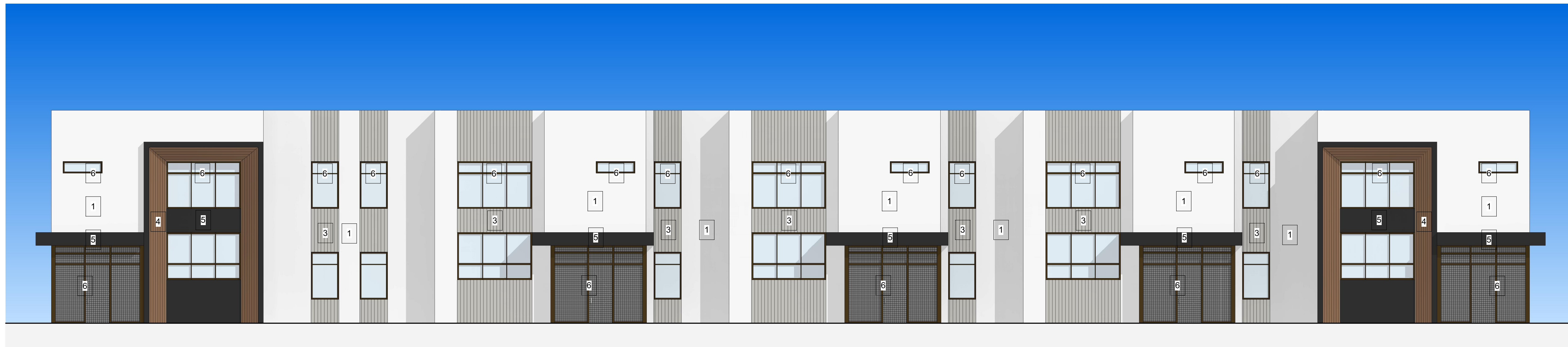
2 BUILDING #8, #9 WEST FACADE