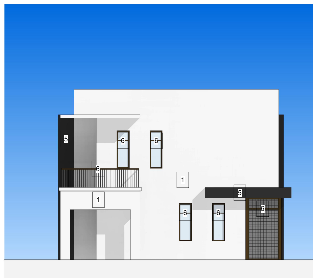
4 BUILDING #8, #9 NORTH FAÇADE